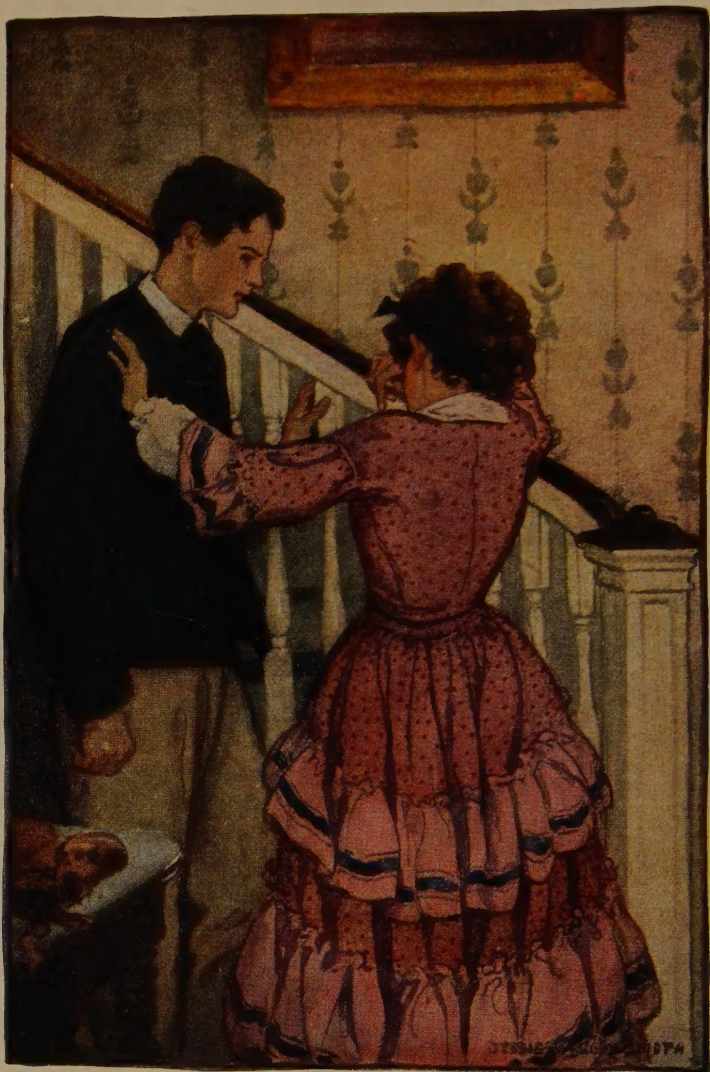
Holding on to the banisters, she put him gently away